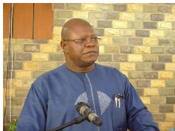
Honorable Abdul Ignosi Koroma

Hon. Abdul Ignosi Koroma, Deputy Minister of Mines and Mineral Resources