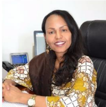
H.E. Fatima Haram-Acyl

QUOTE FROM From African Union Commissioner for Trade and Industry, H.E. Fatima Haram-Acyl