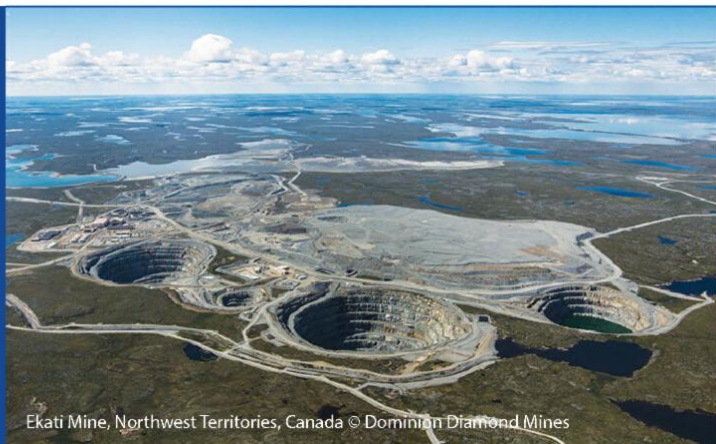
Ekati Mine, Northwest Territories, Canada

30 YEARS OF DIAMONDS IN CANADA 18–20 August 2021 • Yellowknife