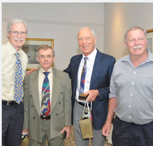
Jubilee Award - SAJG Article