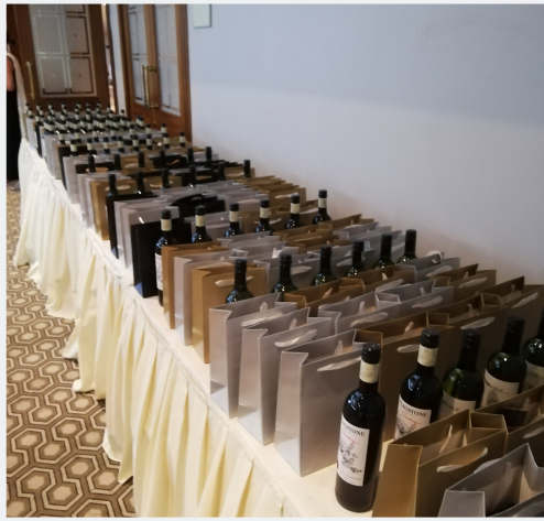
Gifts sponsored by Shango